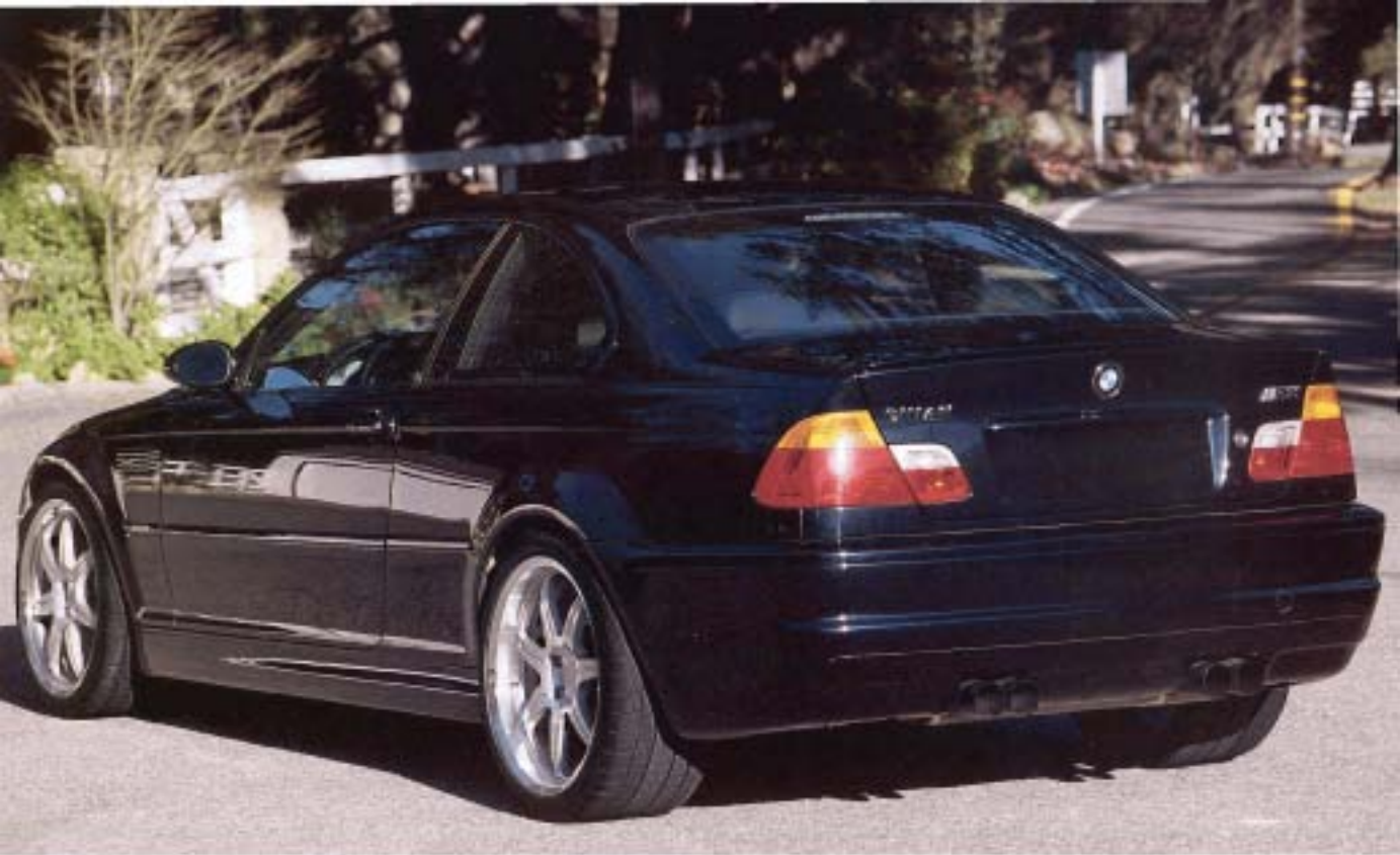
Preserving the M3's original exterior, Dinan's custom wheels and exhaust tips provide the only visual cues to the S3-R's performance capabilities.

extra 66 ft lbs of torque." The design of the engine dictates the engineering package. The BMW engine lends itself well to centrifugal supercharging," Dinan says.